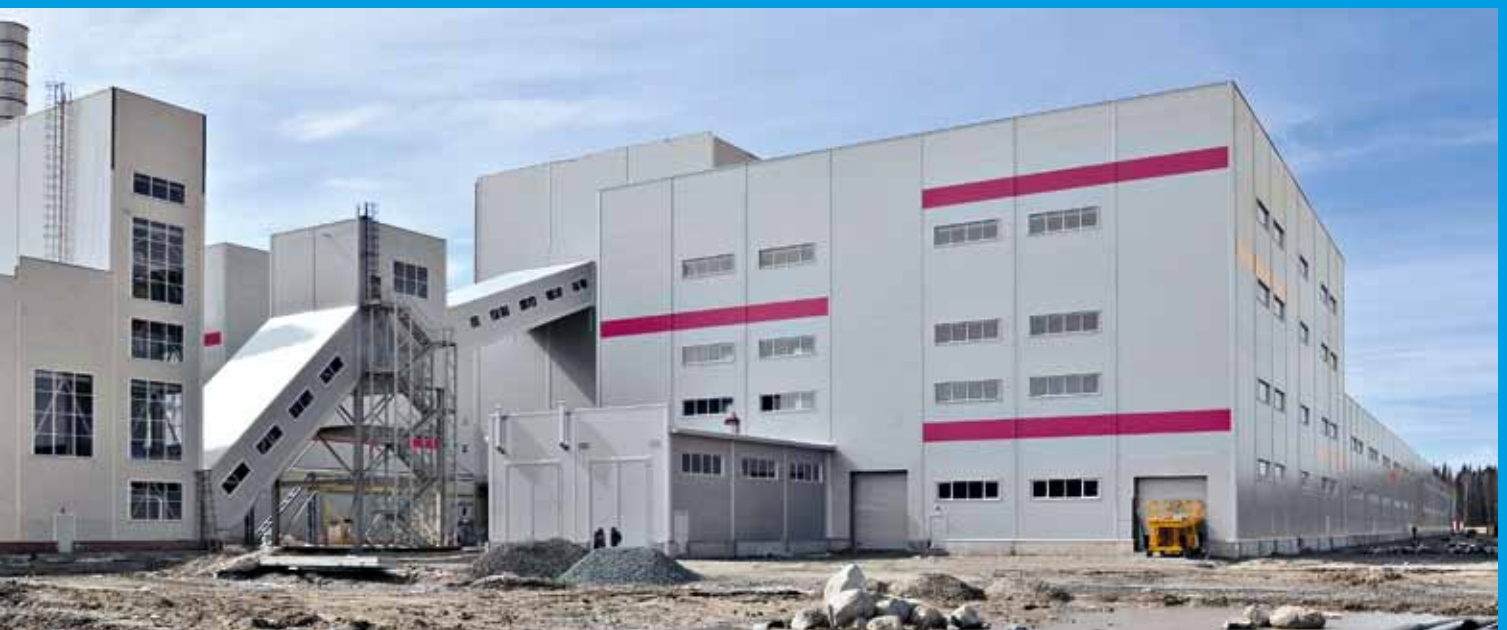
The plant in the Republic of Karelia – totally encapsulated