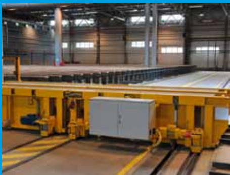
Storage vehicle for the high-stack storage