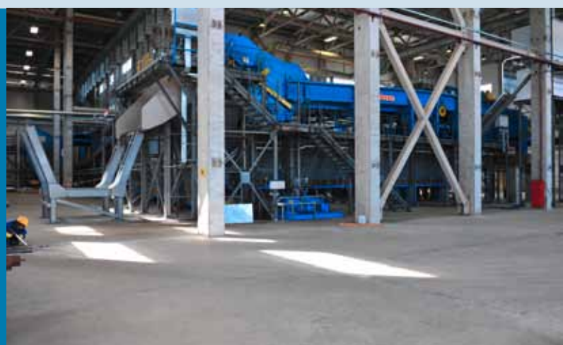
Loghandling and batch feeder for strander