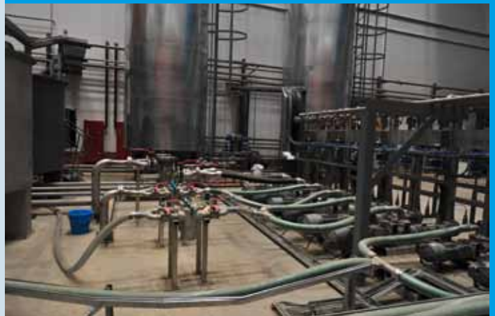
Glue kitchen and dosing system