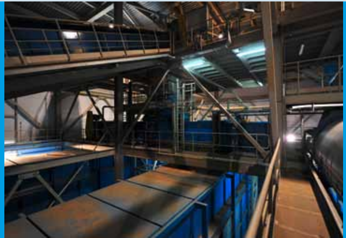
Feeder for the metering bins