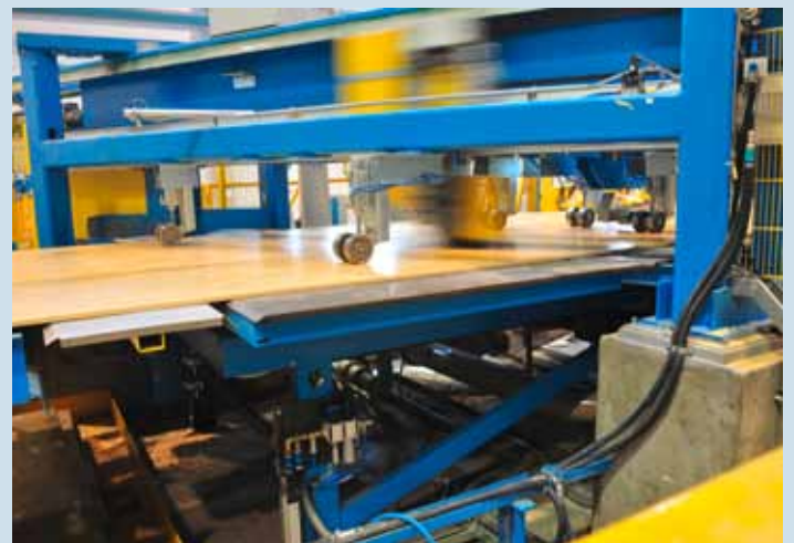
Double diagonal saw