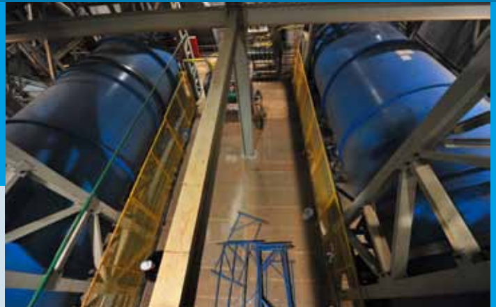
Rotary drum blenders

Over the years the ContiRoll® has been continuously adjusted to the growing demands of our customers regarding product quality, user-friendliness and the development of new materials. The focus here has been primarily on the operating efficiency of the plants. Meanwhile, we have introduced Generation 8 of our continuous press to the market. Today there are three designs available featuring widths of 4' to 12' and press lengths up to 77 m. This means each customer can select the optimal press regarding board size and capacity requirements. The OSB plant for Kalevala includes a 9' x 50.4 m ContiRoll®.